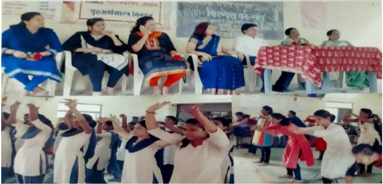
Girls are doing the various yogasanas and enjoying the fitness workshop.