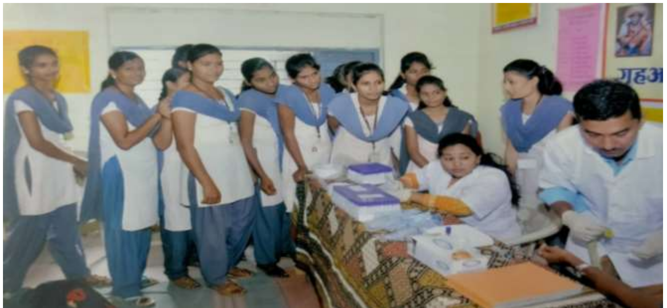
Girls in the rows getting ready to test their blood